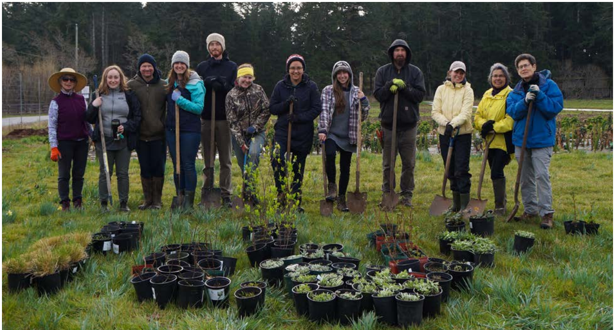
Habitat Acquisition Trust, Saanich