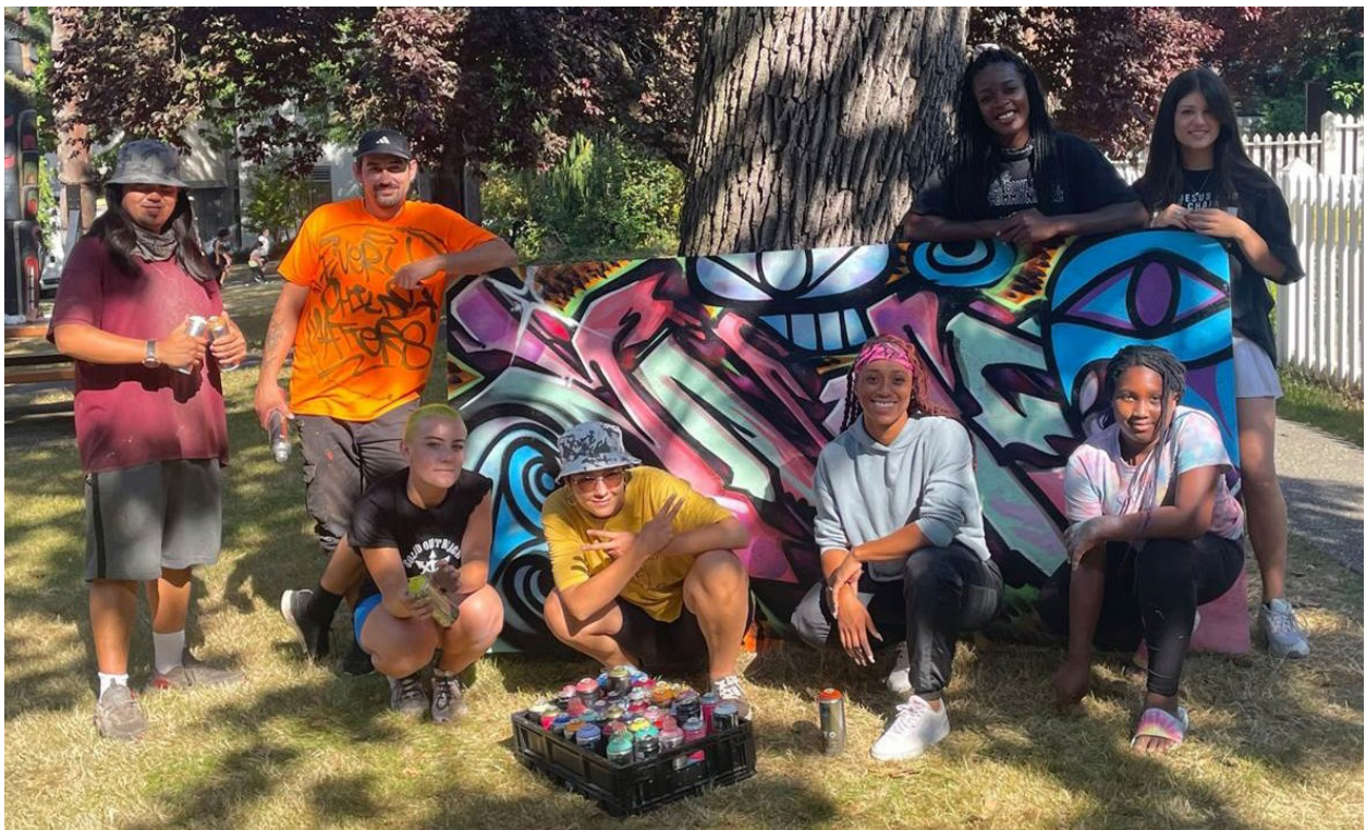
B.C. Black History Awareness Society, Victoria