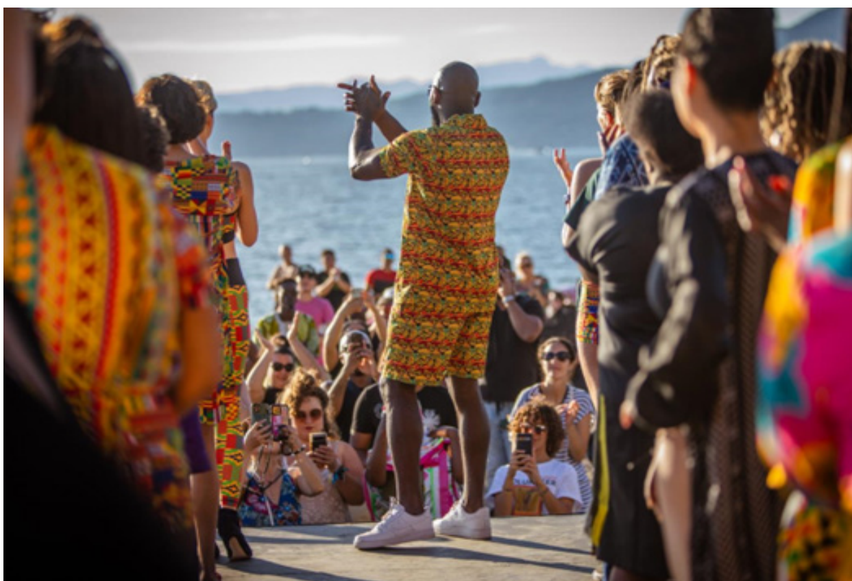
African Descent Festival Society, Vancouver