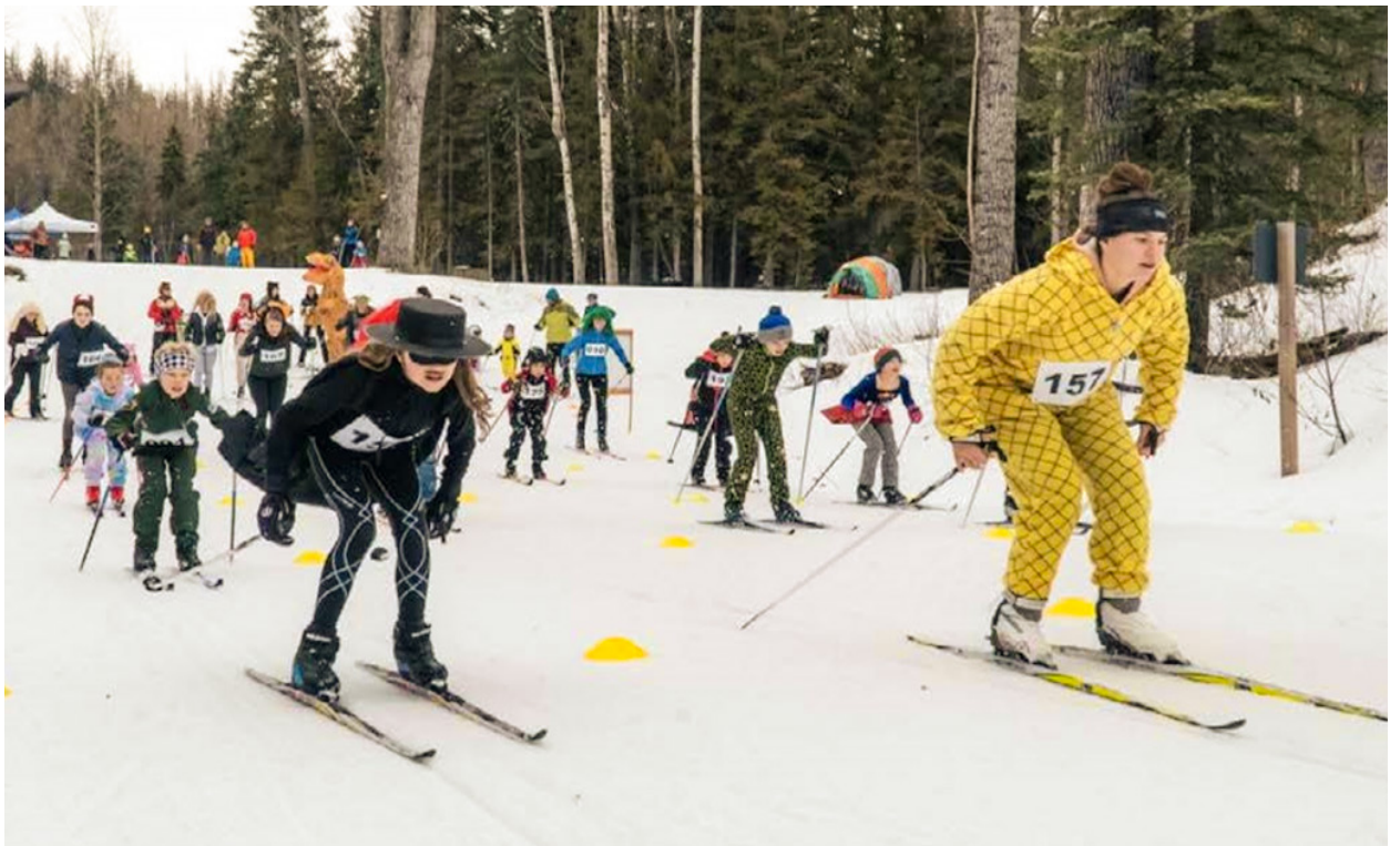
The Fernie Nordic Society

Prior to applying, applicants should read all relevant chapters and appendices of the Program Guidelines to ensure that they understand all eligibility requirements for receiving a grant.