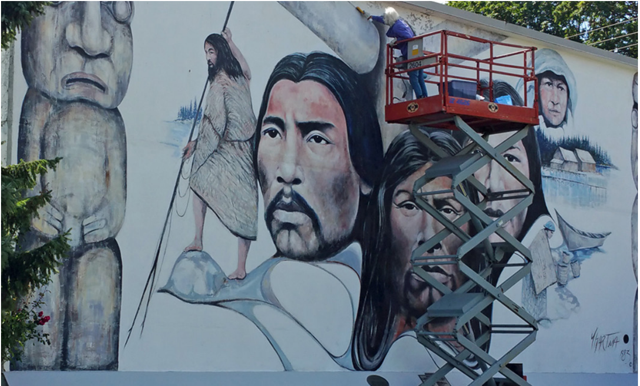
Cheminus Festival of Murals Society.

Regardless of the service delivery status of an organization, each application is assessed on its own merit, based on the size and scope of the programming presented.