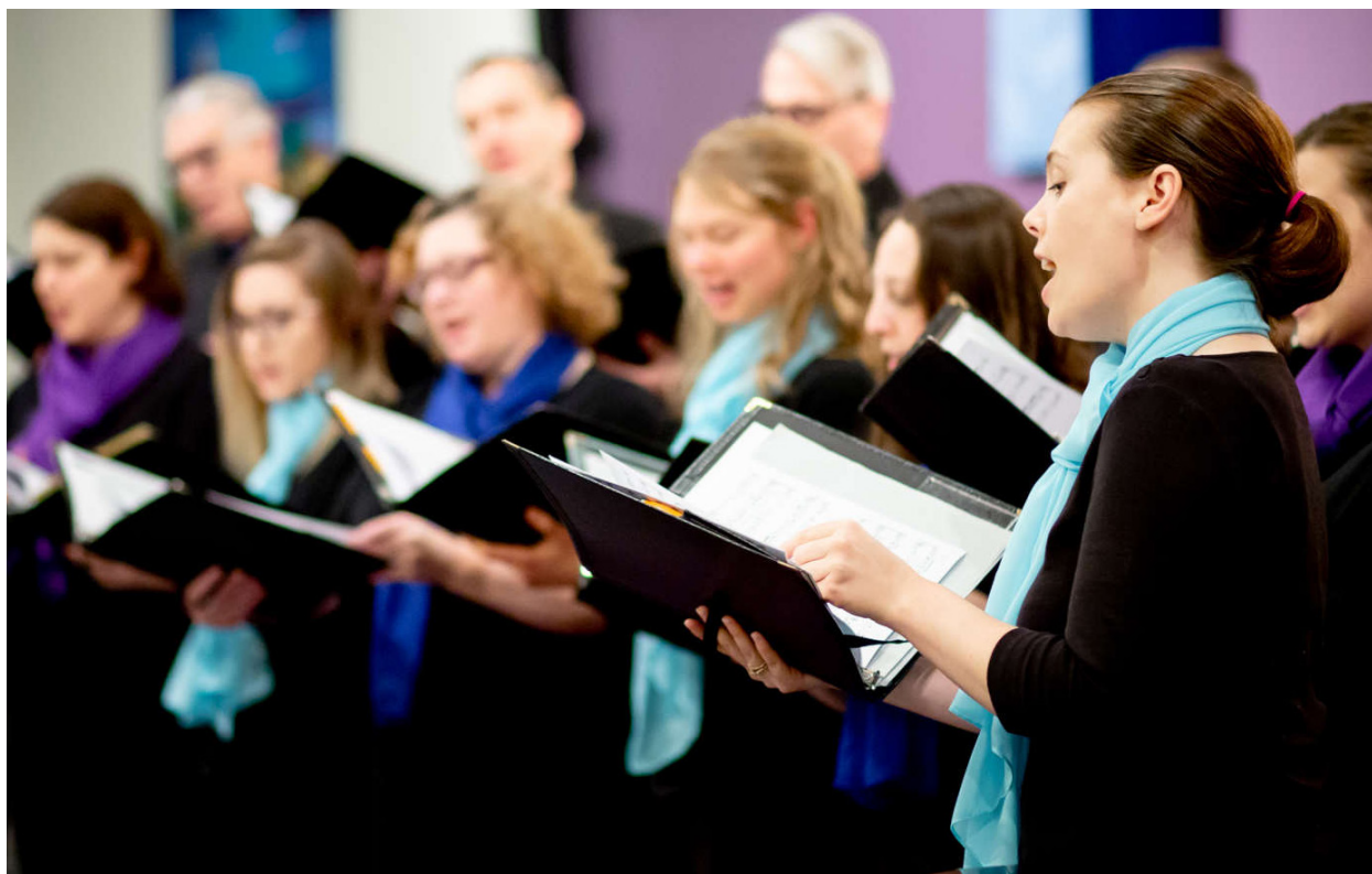
Les Echos du Pacifique , Coquitlam

See Appendix I for other factors the branch takes into consideration when assessing requests for levels of funding greater than Local.